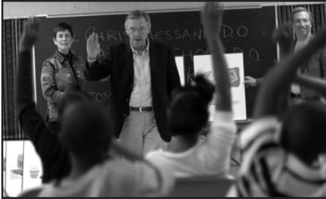
Our DO leaders shared fitness information with Chicago grade school students (for more information, see the Presidential Report).