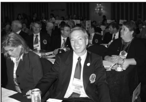
The delegation between votes on the House Floor