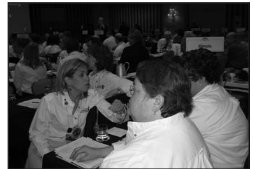
Illinois delegates on Sunday, the final morning of the House