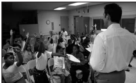
Students were very eager to learn.