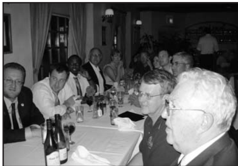
Many generations of DOs were represented in our delegation, dining here Friday at Costa's in Greektown