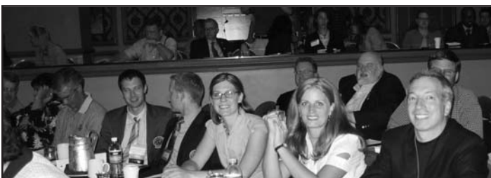
Delegation participates in our UFOS Caucus—This caucus of small to medium sized state delegations now represents more than 45% of the House votes