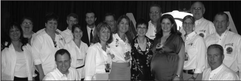
Your IOMS Delegation!