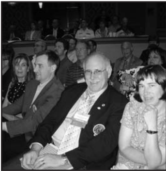
IL delegation participates in the United Federation of Osteopathic Societies (UFOs) Caucus.