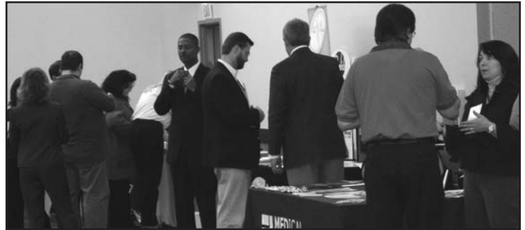
Exhibit Hall during a break