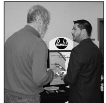
DOs learn from a variety of Pharma representatives