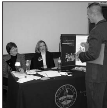
Another long-term supporter is Midwestern University/CCOM