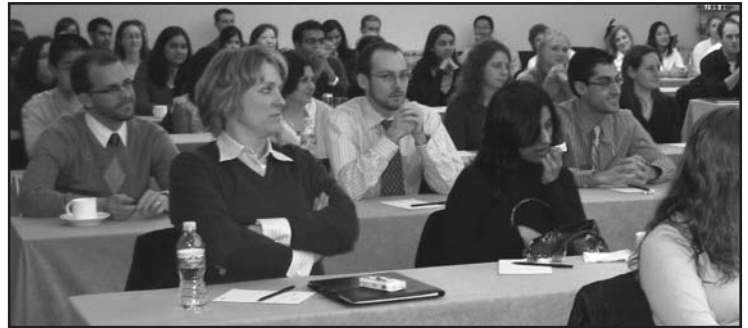
Students packed the room at the Student Session