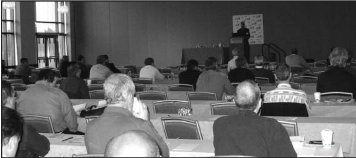
DOs preferred the new classroom with two walls of windows