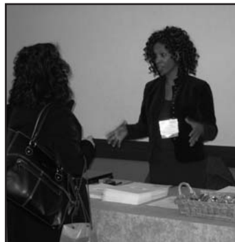
IL DOs met with IL Health Connect about the All Kids Program