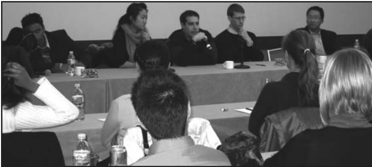
Residents share their experience during Panel for the Student Session