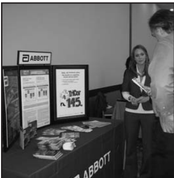
Long-time exhibitor Abbott Labs