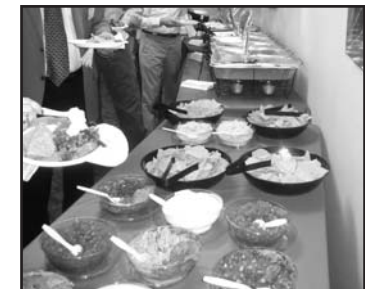
Healthier food this year in deference to topic – Make Your Own Fajitas instead of Giordano's Deep Dish Pizza and Portillo's Hot Dogs Chicago Style!