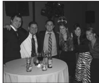
Enjoying the evening.