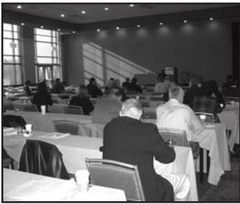
Winter Scientific Seminar 2010 drew 189 DOs from 16 states, including TX, ME, FL, OK, AZ and more. Two-thirds were from Illinois.