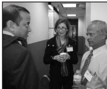
DOs network between sessions