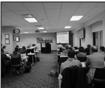
View from the back of the AOA Conference Center