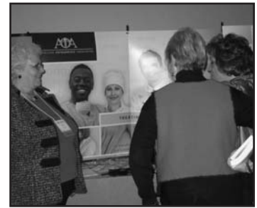
2010 was our largest Exhibit Hall; shown here is the AOA's exhibit.