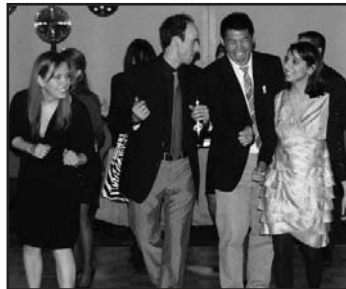
CCOM Students take to the dance floor!